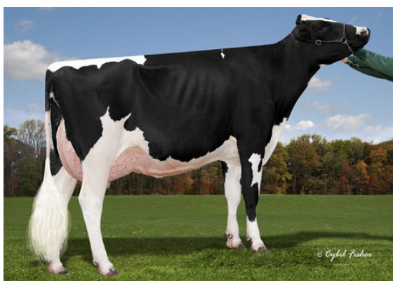
COOKIECUTTER DTA HABITAN GRANDDAM