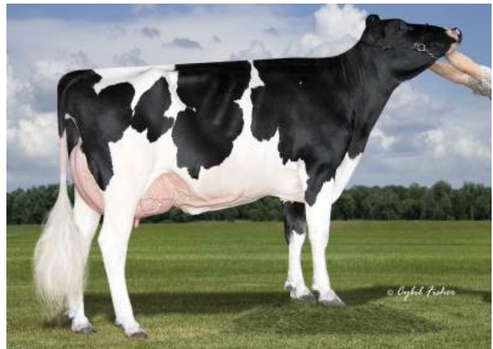
MGD: Aot Salvatore Hiccup-ET