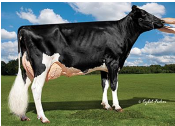
MGGD: Cookiecutter Ssire Has-ET