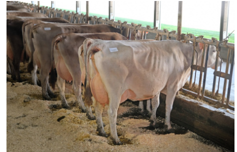
Dam: Hilltop Acres Princess ETV 'E 91 E 91 MS'