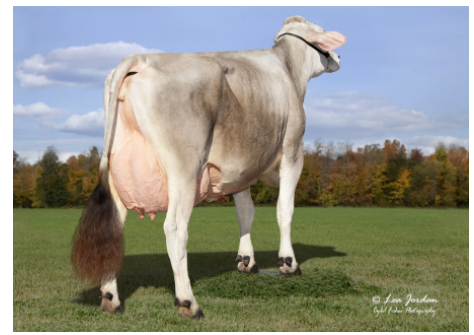
Hilltop Acres Princess ETV 'E 91 E 91 MS' DAM OF 54BS625 PRINCE

Sire: Pactole Dam: Hilltop Acres Princess ETV 'E 91 E 91MS' 1-11 305d 3x 24,510 4.8 1,169 3.6 877 2-11 365d 3x 44,160 5.7 2,525 3.8 1,696 MGS: Hilltop Acres D Kickstart ET MGD: Hilltop Acres Cad Paula 'VG 87 VG 87 MS' 1-11 365d 3x 32,990 4.6 1,522 3.8 1,257 7-3 365d 3x 38,860 4.8 1,878 3.7 1,433