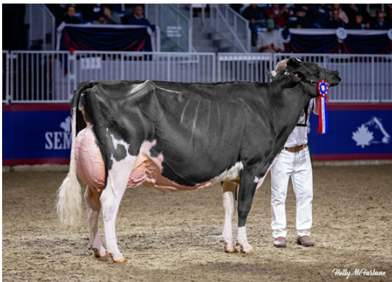
JACOBS HIGH OCTANE BABE DAM