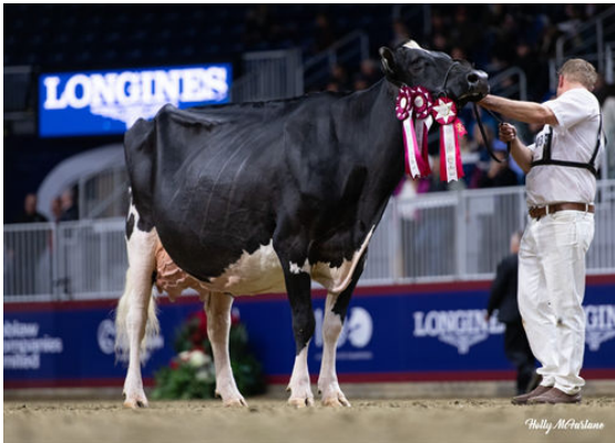
JACOBS HIGH OCTANE BABE DAM