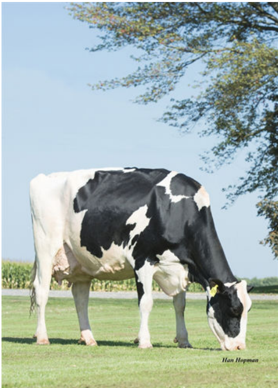
KINGS-RANSOM MG CLEAVAGE THIRD DAM