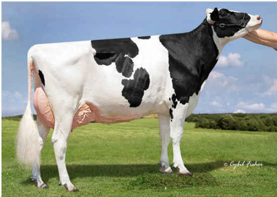
KINGS-RANSOM KROY CLIMAX GRANDDAM