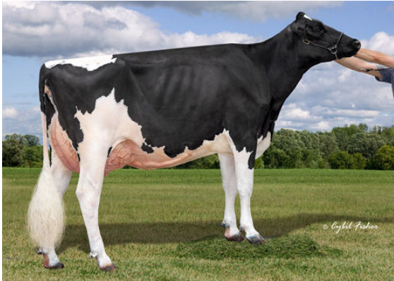
KINGS-RANSOM CASP DAZE DAM