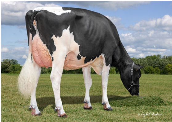
KINGS-RANSOM CASP DAZE DAM