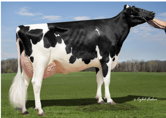
KINGS-RANSOM DELTA DESTINY GRANDDAM