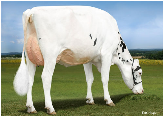
LADYS-MANOR GRNT OOHM DAM