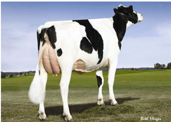
LADYS-MANOR DORCY ODA THIRD DAM