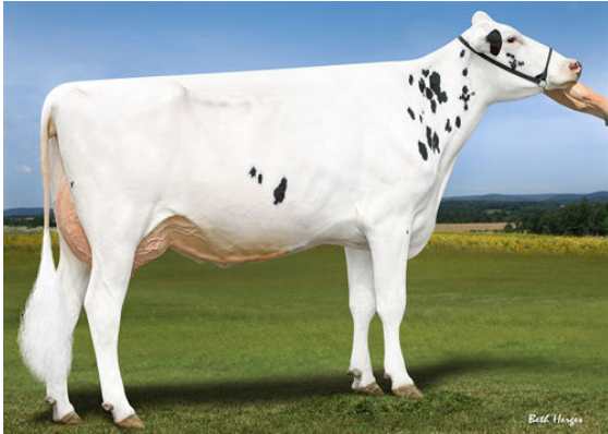
LADYS-MANOR GRNT OOHM DAM