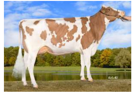
M: RUW Serena