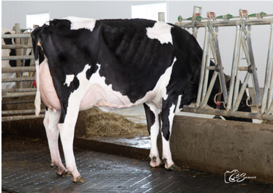
PROGENESIS PURSUIT DIETIES DAUGHTER