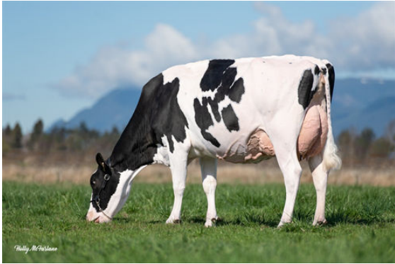
WESTCOAST PSUIT LAUMAB 8996 DAUGHTER