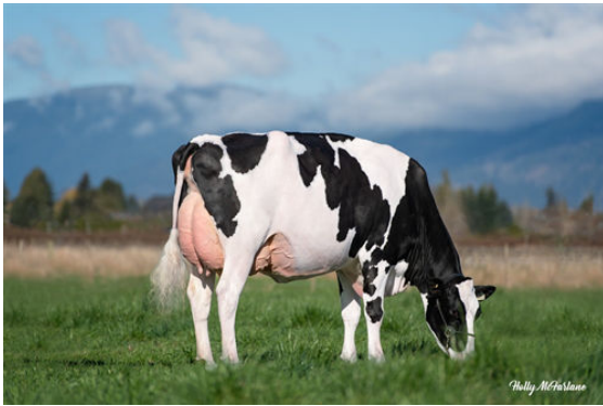
MYSTIQUE LAMBDA ANIS DAM