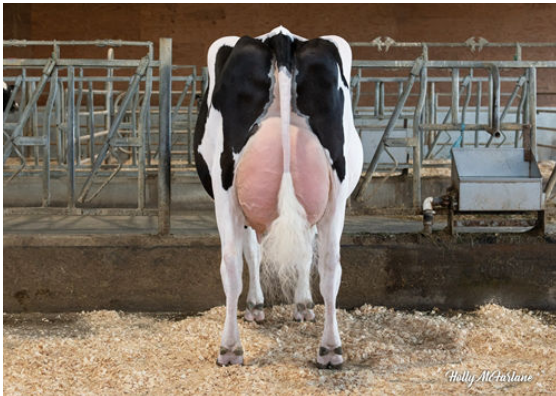
MYSTIQUE LAMBDA ANIS DAM