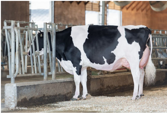
MYSTIQUE LAMBDA ANIS DAM