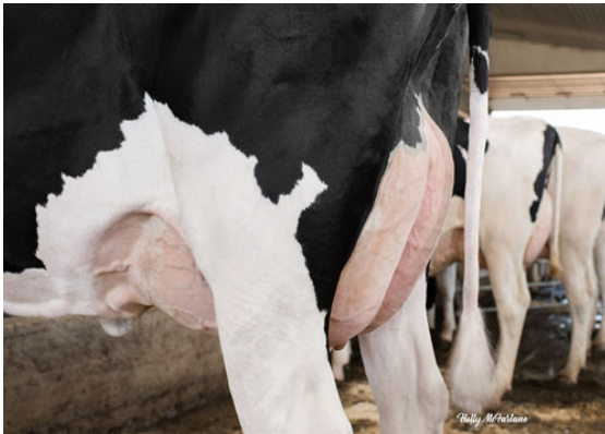
PROGENESIS FORTUNE PALAU THIRD DAM