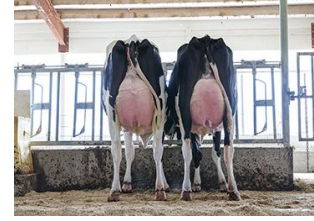
Siemers Conway Daughter Group