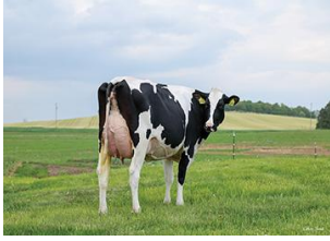
Siemers Cway Paris 36932