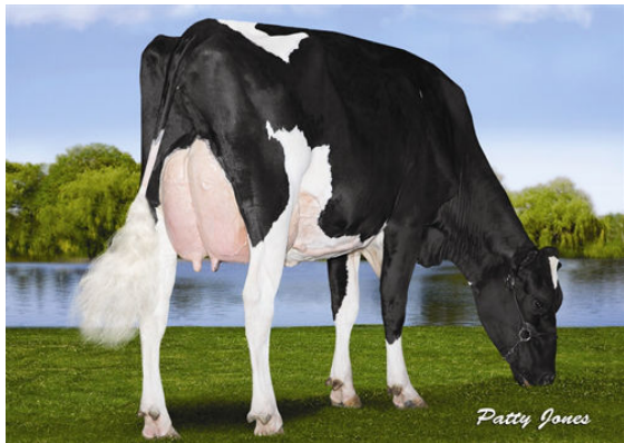
RANSOM-RAIL FACEBK PARIS FOURTH DAM