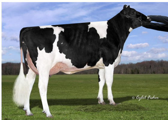
SIEMERS DENVER PARIS GRANDDAM