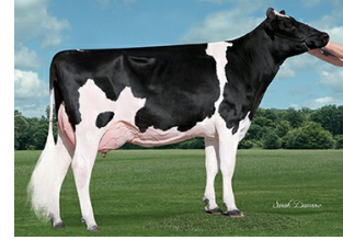
MGGD Quality Tango Paris