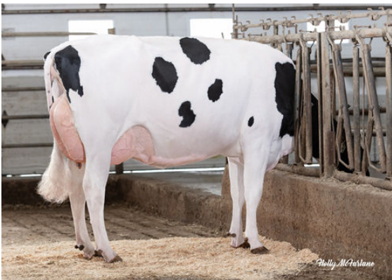
PROGENESIS EINSTEIN WIMZY DAUGHTER