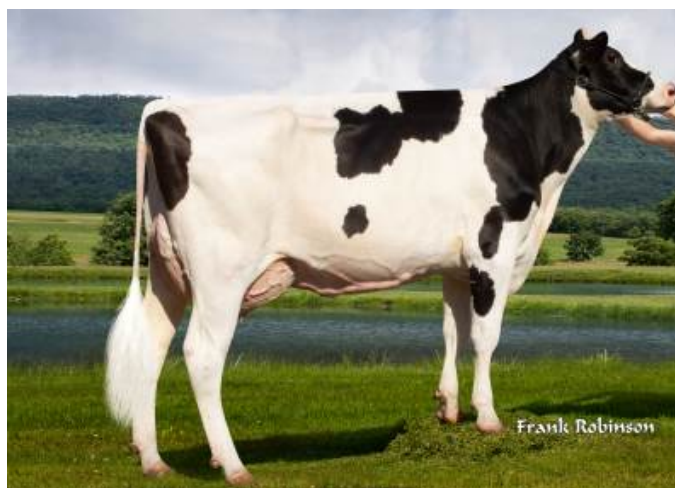
Dam: Fairmont Salvatore Doris-ET