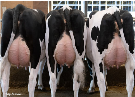
LAMBEAU DAUGHTER GROUP L TO R - WISSELVIEW LAMBEAU DIX, WISSELVIEW LAMBEAU DIXIELEE, WISSELVIEW LAMBEAU DIXEE