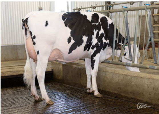
DUPORTAGE LAMBEAU IMONICA DAUGHTER