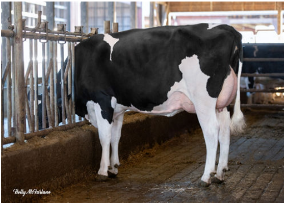
WISSELVIEW LAMBEAU DIX DAUGHTER