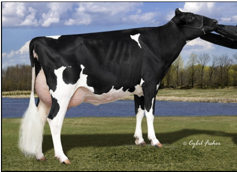
BENNER FORK JANARDAN FOURTH DAM