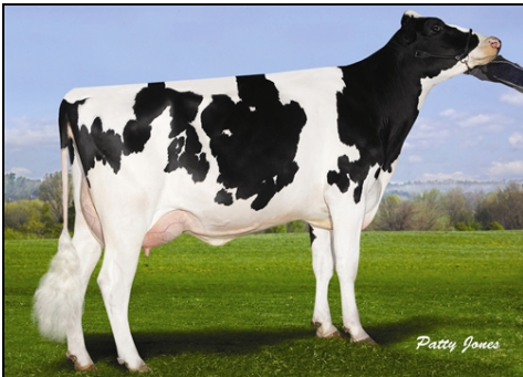
BENNER PLANET JAKOVA FIFTH DAM