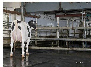
Alexerin Marlon 1763 Alexerin Dairy Inc.; Manotick, ON