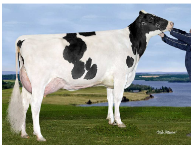
Alexerin Marlon 1763 Alexerin Dairy Inc.; Manotick, ON