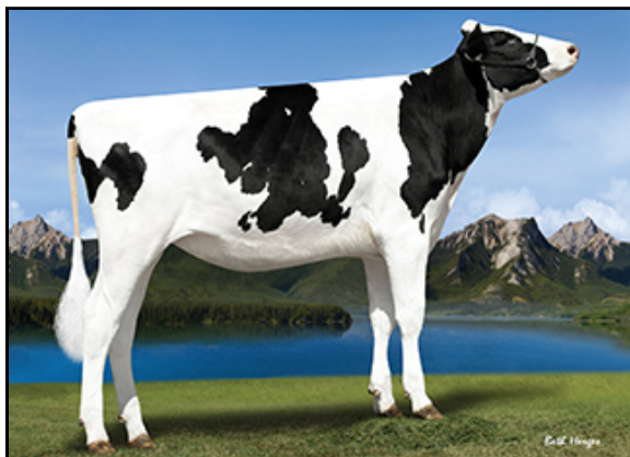
Dam: Hermanville Dashe-ET