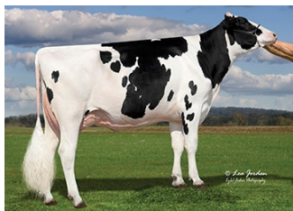
DAM Y-Whisper Silver Royalty-ET