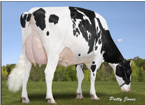
WALNUTLAWN DOORMAN BREANNA