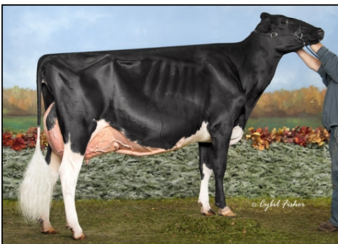
COMESTAR LAMADONA DOORMAN