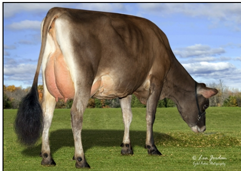
DP AXIS MCKENNA 1983 GRANDDAM