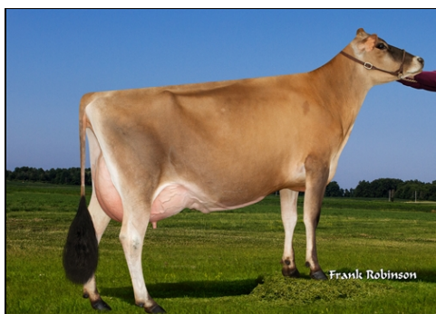
SHJ LISTOWEL MACKENZIE DAM