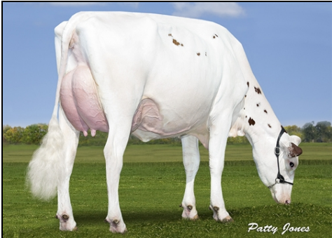
SNOWBIZ LADD P MARSHMELLOW GRANDDAM