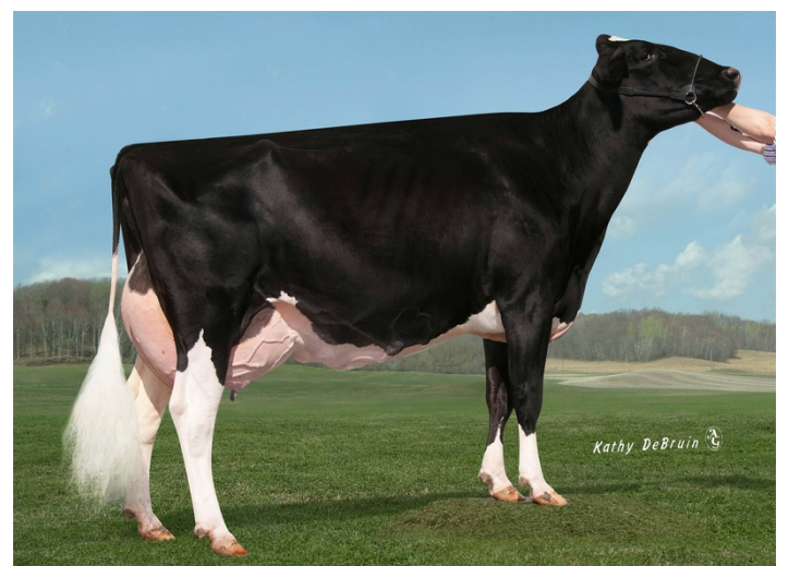
Granddam: Gloryland-I Goldwyn Locket EX-94