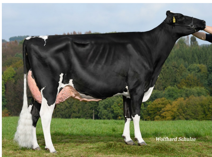
Dam: Locket RDC 2. LA