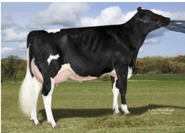
MGGD: Cookiecutter Mom Halo-ET