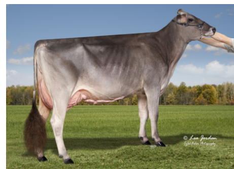
Cutting Edge D Trish Intermediate Champion - Southwest Fall National 2020 Owned by Edge-View Genetics, NY & KY