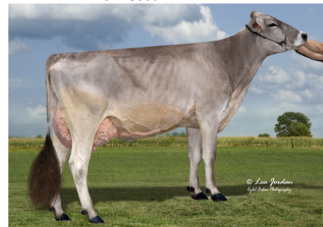
Hills Valley Daredevil Wobble 2nd Lact. Maternal sister to 54BS567 WATCHOUT Owned by Hills Valley Farm, New York