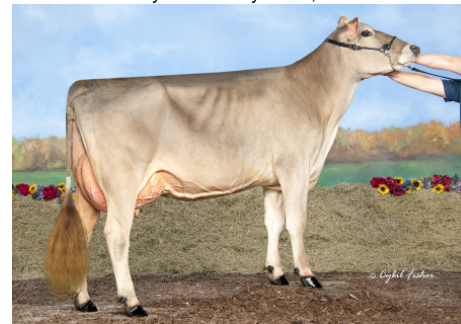
Cutting Edge D Neema Reserve Intermediate Champion Northeast All Breeds Show 2020 Owned by Edge-View Genetics, NY & KY