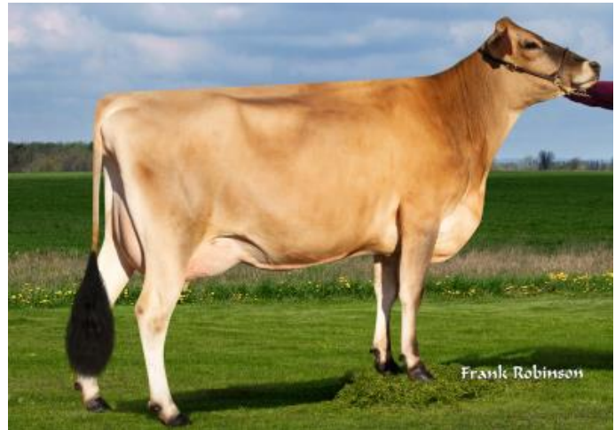
Dam: Ahlem Bancroft Harmony 50863