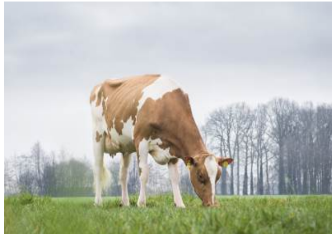
Dam Wilder Daffy 60 P Red VG-85