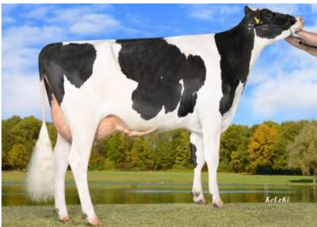
GDam Wilder Dafnation PP VG-87