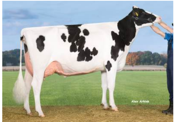
MGD: DROUNER K&L AIKO 1398 VG-89

MGGS: Rr Bestboss TL TV TY MGGD: Drouner Ajdh Aiko 1267-ET