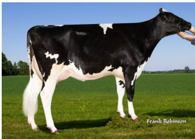
Daughter: STgen Captain 90837-ET