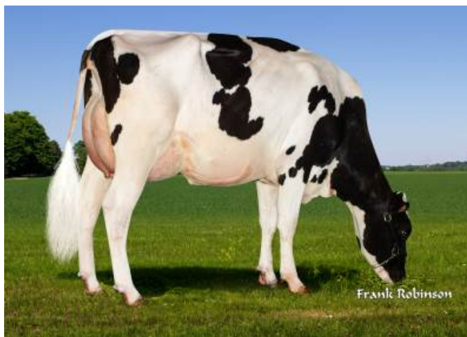
Daughter: STgen Captain 89400-ET