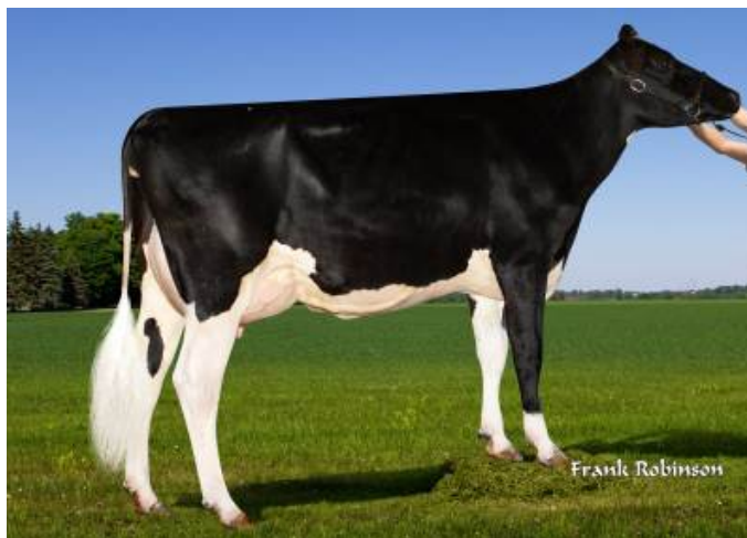
Daughter: STgen Captain 89875-ET