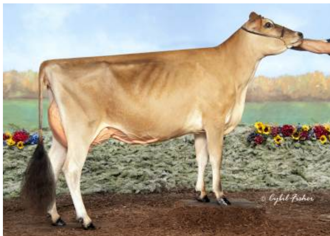
Dam: River Valley Citation Lovely-ET EX-90