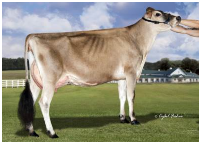
MGD: Goldust Karbala Laina-ET