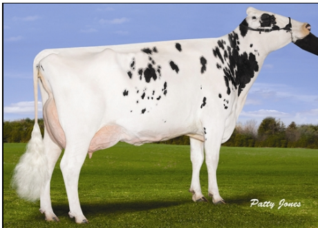
GEN-I-BEQ SHOTTLE BOMBI FIFTH DAM