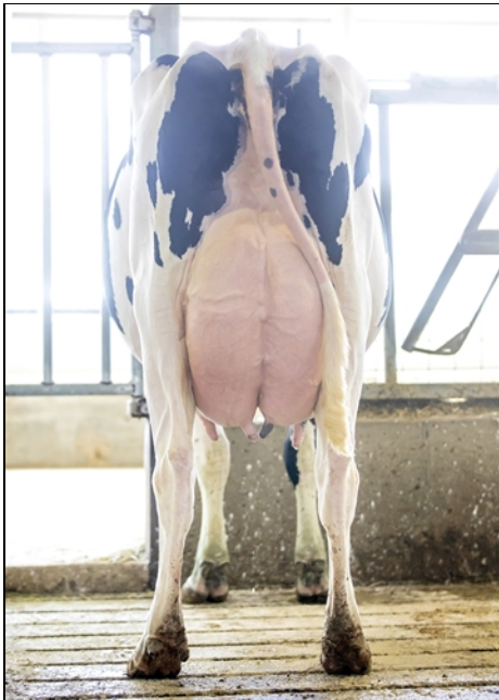
SIEMERS TRJ BROOKE 28030 DAM