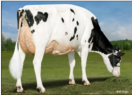
PINE-TREE 7593 TIMB 8543 DAUGHTER