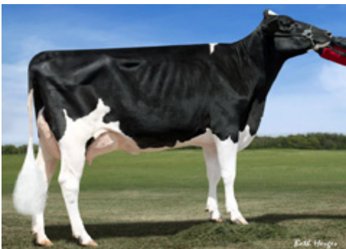
MGGD: Kellercrest Manoman Lacy-ET