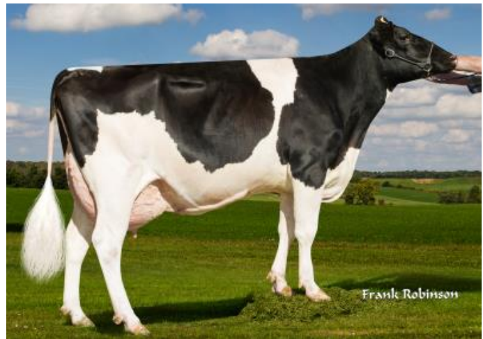
Dam: St Alana Rub 54761-ET