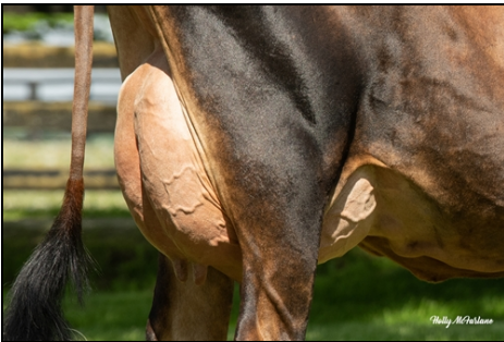
SPRUCE AVENUE VIDEO MONTAGE DAUGHTER