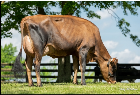
SPRUCE AVENUE VIDEO MONTAGE DAUGHTER