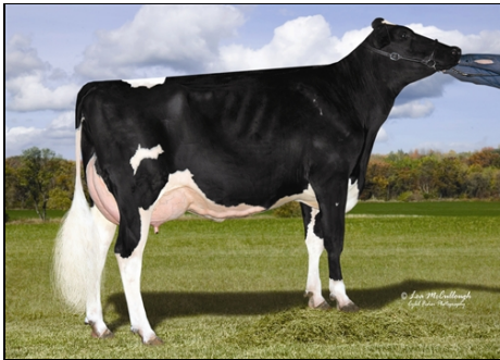
COOKIECUTTER MOM HALO FIFTH DAM