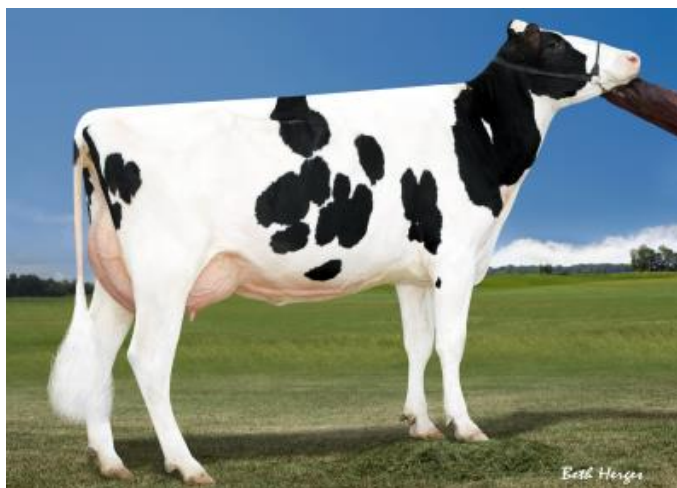
MGD: Miss Ocd Robst Delicious-ET