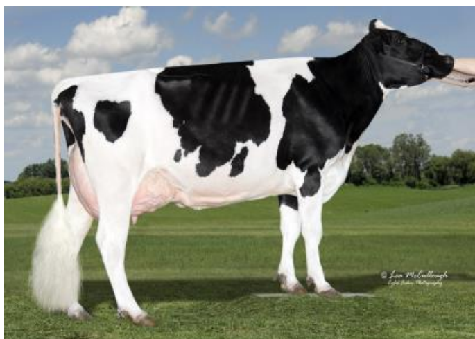
MGGD: OCD Planet Danica-ET