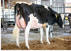
DAM Sandy-Valley Tencil-ET