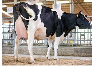
MGD Siemers Denver Paris-ET