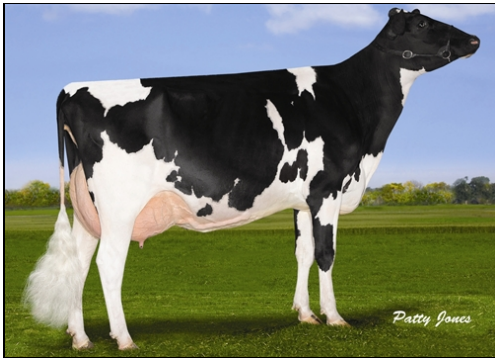
COMESTAR LAUTAMAI MAN O MAN FIFTH DAM