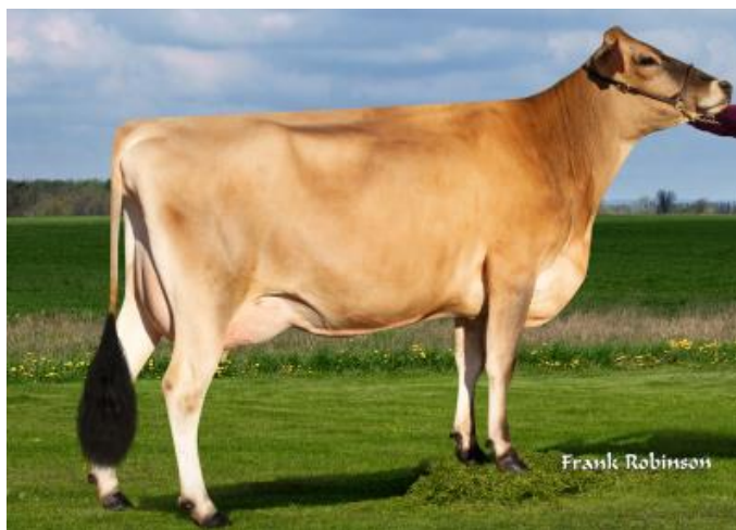
Dam: Ahlem Bancroft Harmony 50863